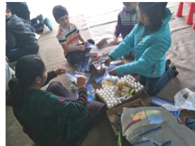
Packing Essential Supplies for distribution to people in need