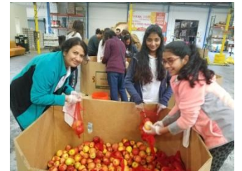
Food distribution to homeless by San Francisco Bay Area Chapter